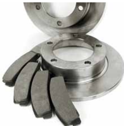
Friction lining products Colored plaster Refractory products

By combining with EIRICH vacuum technology it is also possible to achieve high levels of homogeneity and rates of disagglomeration for ultrafine material systems involving the need for small quantities to be mixed in homogeneously, e. g. pigments. Removing the air from the material can facilitate the transfer of higher shearing forces and thereby enable even heavily agglomerated raw materials to be completely disintegrated and mixed in homogeneously.