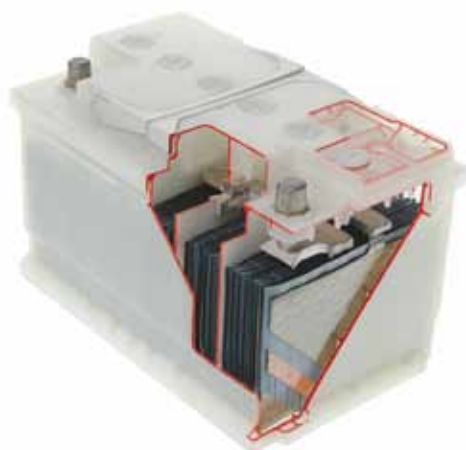
Lead acid pastes for starter batteries Pesticides Engobes/glazes for roof tiles

These are supplemented by large-scale TowerMill agitated media mills for bulk products such as ores.