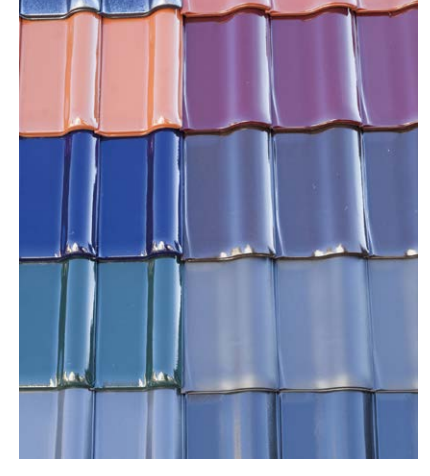
Engobes/glazes for roof tiles