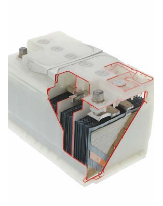
Lead acid pastes for starter batteries

These are supplemented by large-scale TowerMill agitated media mills for bulk products such as ores.