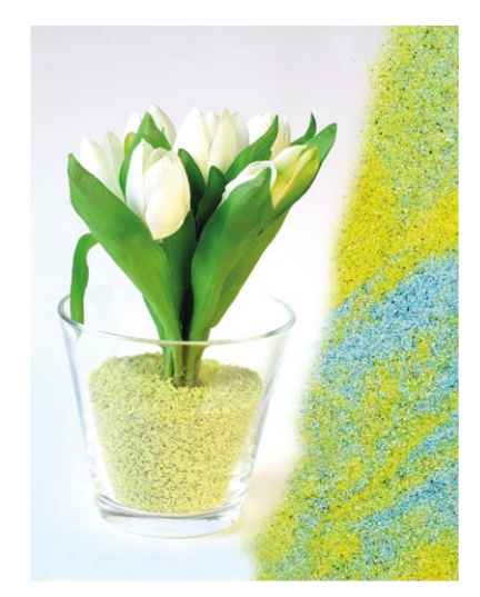
Colored decorative sand