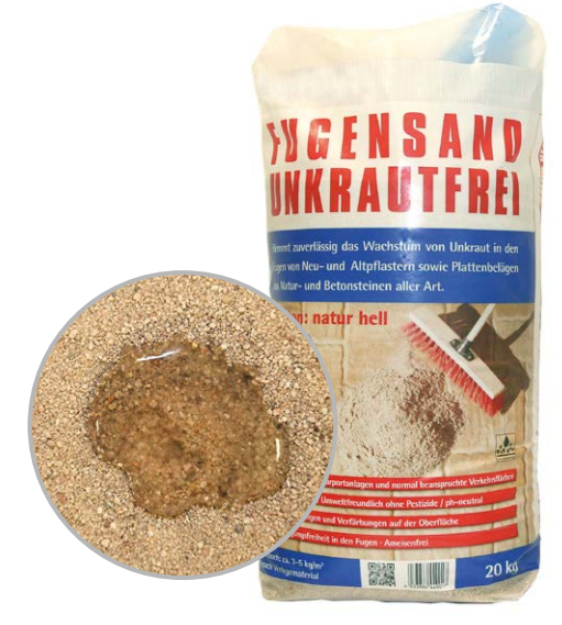
Hydrophobic jointing sand