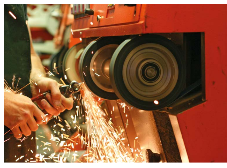
Abrasive grit for grinding wheels